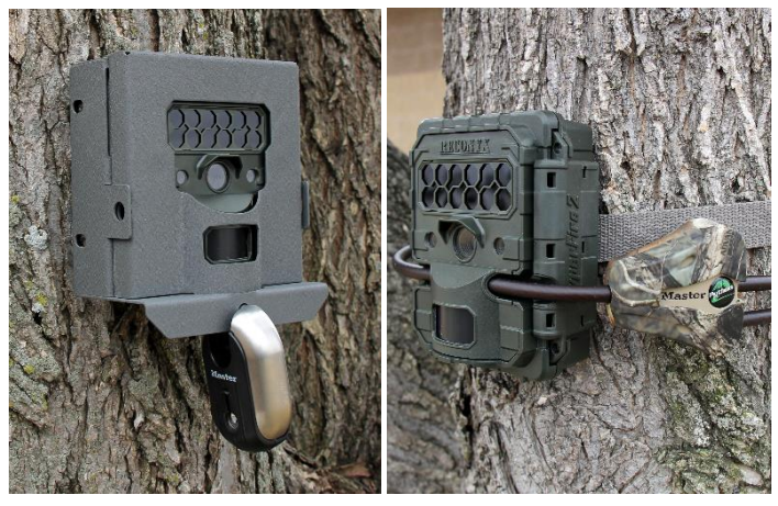
HyperFire 2<sup>™</sup> Security Enclosure